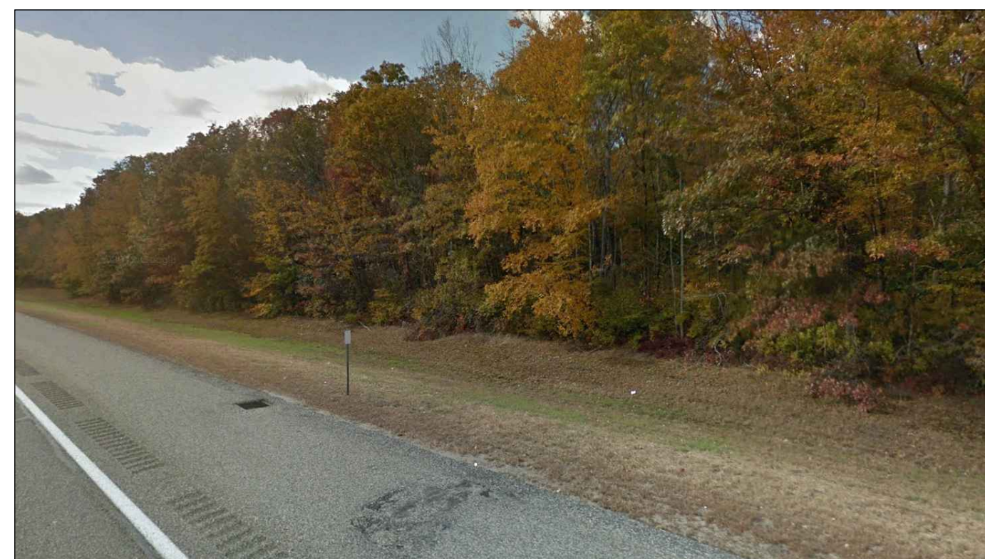
VIEW FROM I-95 SOUTHBOUND