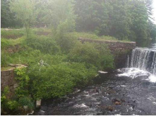
Downstream of Right Embankment