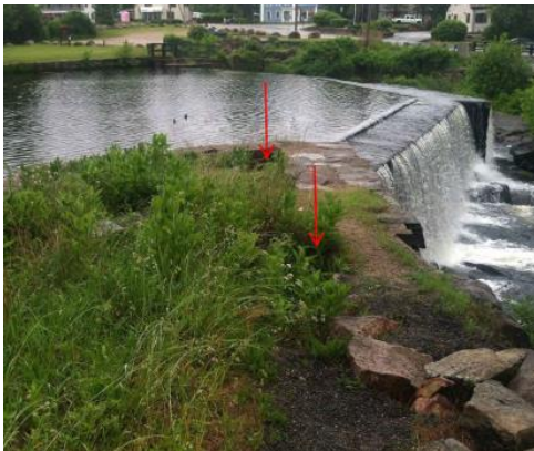
Spillway & Right Embankment