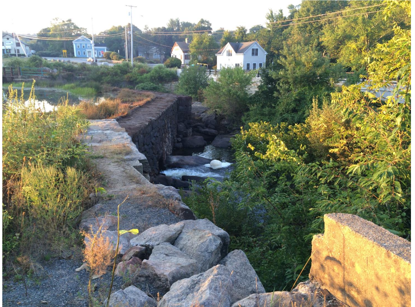
View of dam from right embankment- Prospect Square, Hopkinton