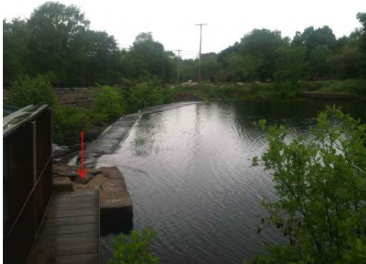
Top of Spillway